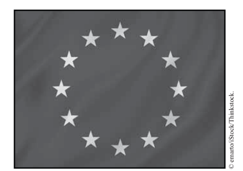
The European Union is now only one among many supranational interstate organizations, including the African Union and the Association of Southeast Asian Nations.

Subsequently, more treaties were signed. expanding the European Common Market and additional creating higher-order governance institutions. This process culminated in the signing of the Maastricht