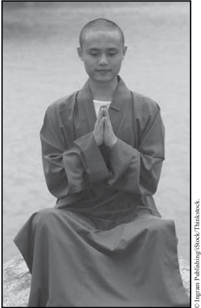
Buddhism originated in India and has made a modern comeback there, but it is found much more extensively in other parts of Asia.

The cultural hybridization described above is not unique to "popular culture." Consider Buddhism. Buddhism developed in the Indo-Gangetic Plain in what today is India around the 6<sup>th</sup> century B.C.E. Part religion, part philosophy, Buddhism was practiced in a distinctive way throughout India in the centuries following the birth of the tradition.