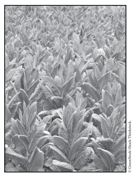
Production of tobacco, as well as sugar, cotton, and other commodities, contributed to the development of new economic geographies during the period of colonialism.