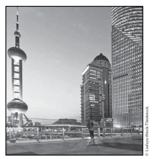
The connectivity enabled by commercial intermodal freight transport links manufacturers and exporters in China with consumers in London or New York.

In the recent dynamic global shift of economic activity, transportation is key. Using commercial intermodal freight transport, which ties shipping together in