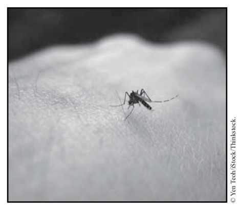
People and other species, such as horses, can catch West Nile virus from mosquitoes but, for complex reasons, cannot pass the disease back to a new mosquito host.

• The first case of West Nile virus in North America was reported in New York City in the late summer of 1999. Within weeks, dozens of birds contracted some kind of unidentifiable