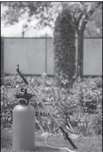
Runoff from commercial agriculture is a detriment to waterways, but that from urban land uses, especially lawns, has been found to be a more serious contributor to the problem in many places.

• Some political ecologies can be very close to home, like the turfgrass lawn in America. Lawns are the largest irrigated crop in the United States, and cover some 128,000 square kilometers (31 million acres).