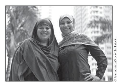
Since the time of earliest Western contact with Southwest Asian cultures through the colonial period and into our own time, the practice of veiling has been a source of fascination and frustration.

• Consider the example of the veil. Many Muslim women practice veiling, which involves the partial covering of the head with a scarf, or hijab. In many religions, there is a general sense that keeping covered is consistent with proper behavior before other people and before God. But