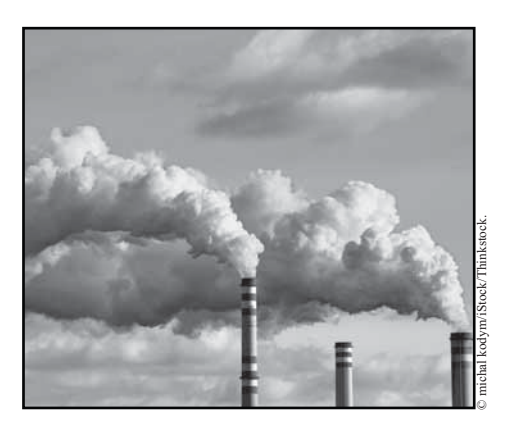
The question facing human beings in the Anthropocene is whether we will create a world in which we ourselves can no longer live.

• Often it regrows into low-value scrubs rather than reverts to the indigenous grassland. For whatever reasons,