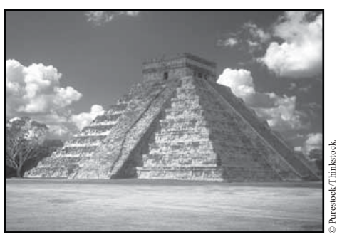
The Maya Classic period (200–900 C.E.) was characterized by vast temple complexes, trade networks, and enormous markets, but after 1000 C.E., Maya civilization largely departed the lowland Yucatán.

Scientists speculate that climate change had implications for the Maya civilization. Beginning around 300 B.C.E., a group of people entered the lowlands of the Yucatán peninsula, in what today are