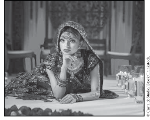
The size and success of the Bollywood film industry attests to the remarkable diversity of the global cinema landscape.

of culture; yet, for consumers worldwide, a single, homogeneous, and uniform film product is not the only one offered. Entire regional film traditions are growing, in part due to the same globalizing forces of the economy that tend to flatten culture.