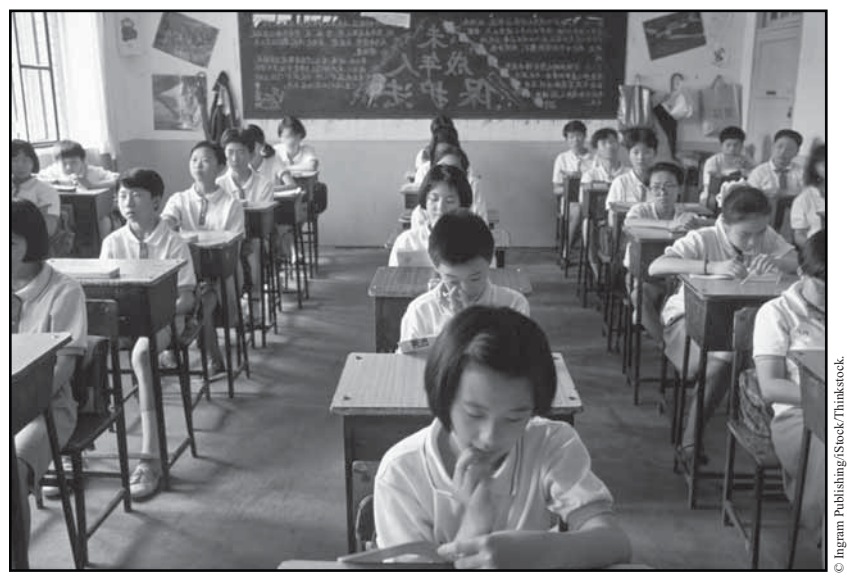
Migrants often adopt the dominant language of the urban area to which they move, and their children are less likely to learn the family's original language.