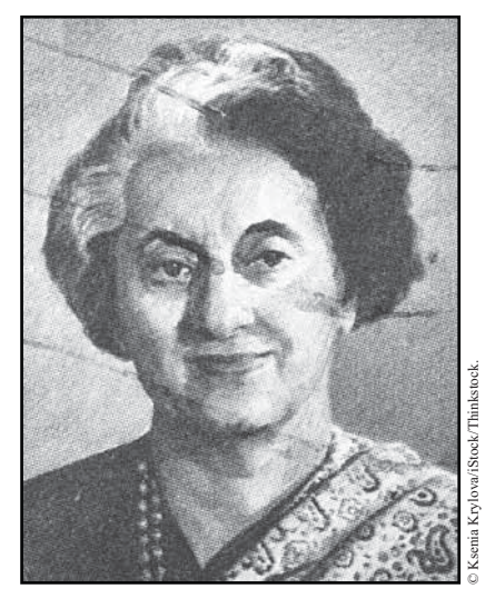
In the 1970s, Indira Gandhi declared a national state of emergency in India; among the measures taken at the time was forced mass sterilization to address the country's growing population.

in 2005 was 1.5 children per woman, whereas in 1980, it was almost 3. But this program has also had numerous perverse side effects, including a lopsided population with more boy children than girl children. This so-called "missing women" situation has resulted from sex-selective abortion arising from a cultural preference for boy children.