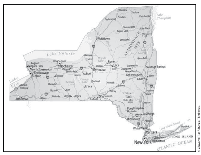
Regions, such as upstate New York, tend to have shared characteristics, including economic systems or political commitments.