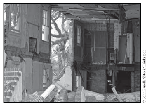
Push factors in migration may include ecological conditions, such as natural disasters and, more globally, rising sea levels.

• The flushing of ice, in the form of water, into the world's oceans has raised the sea levels. Recent research suggests that we could see