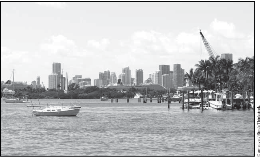
Maps of GDP density tend to highlight the wealth of urban areas and corridors around the world relative to poorer rural areas.